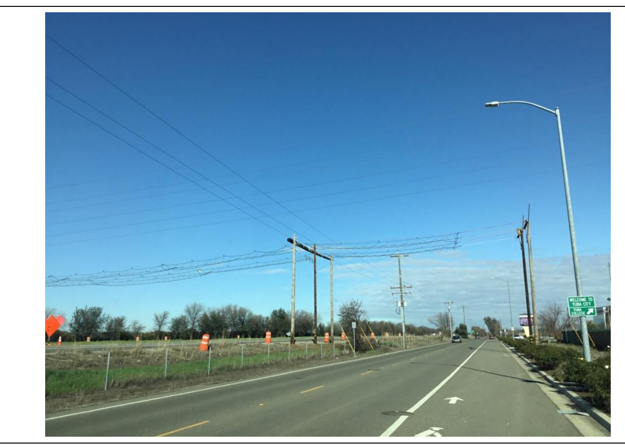
Photo 1: CPUC EM observed installed netting to protect Hwy 99 during wire pulling activities.