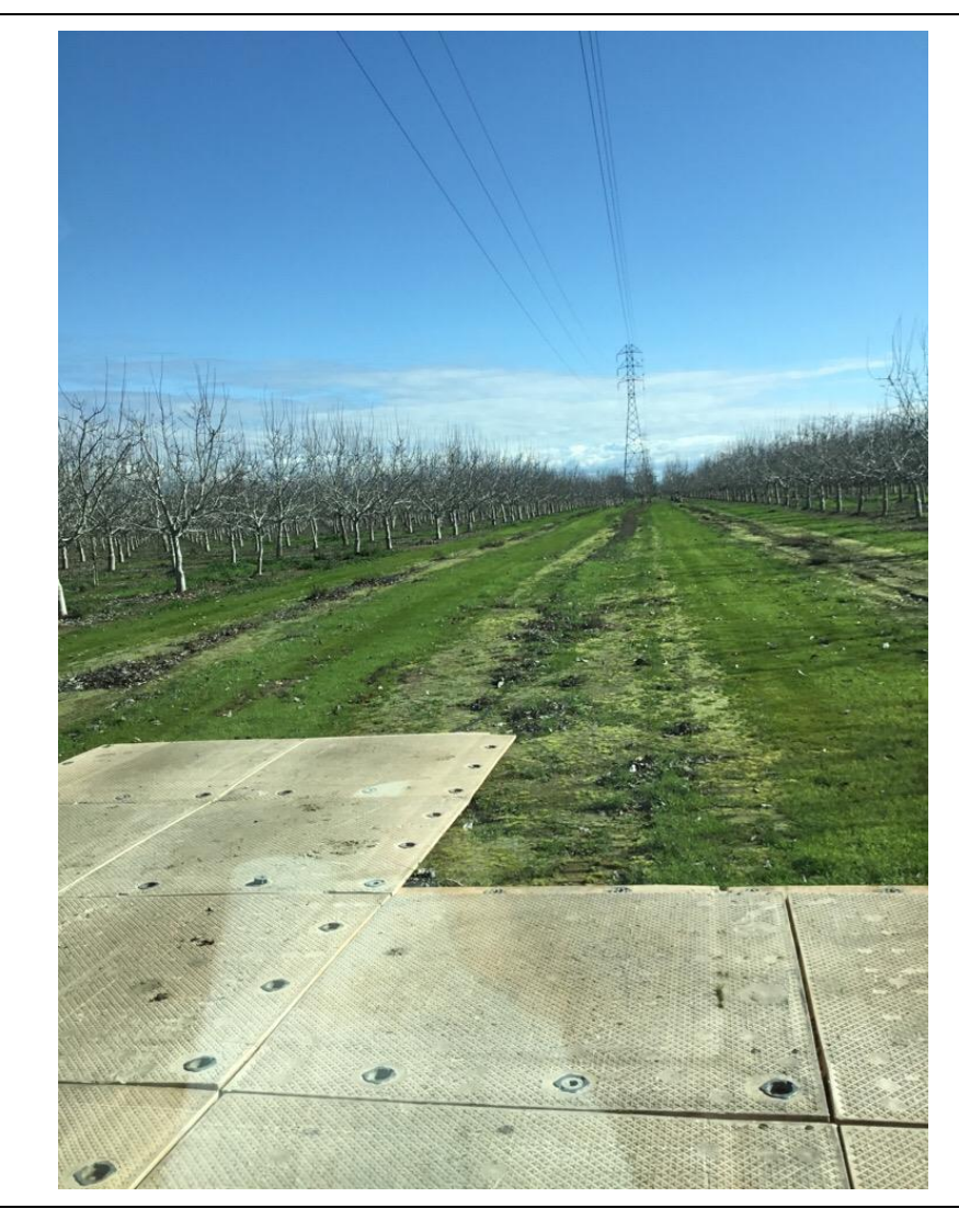
Photo 3 : Mats installed to prevent track-out at structure 5/25, in accordance with APM HYDRO-1.